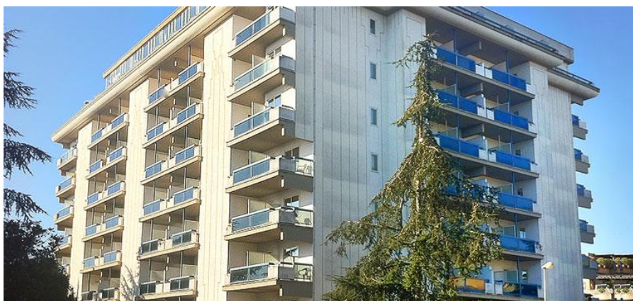
Figure 5 – Hotel Pineta Palace

There are plenty of hotels downtown. If you would like to stay close to the city center please make sure that the hotel is next to a railway station of the FL3 line (Roma S. Pietro, Quattro Venti, Roma Trastevere, RomaOstiense).