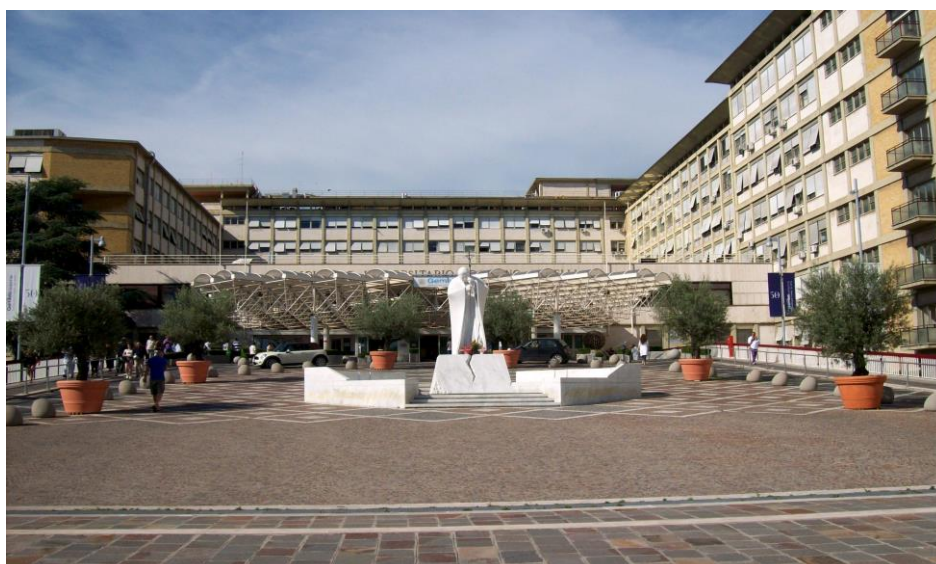
Figure 2 - Main entrance of UCSC/Gemelli Hospital