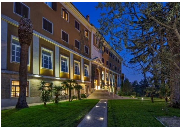
Figure 4 – Hotel Excel Montemario