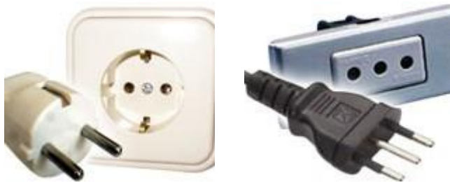
Figure 6 – Types of plugs and sockets in Italy

In Italy the standard voltage is 230 V. The standard frequency is 50 Hz. The power sockets that are used are of type F (also works with plug C and E) and L (that works also with plug C).