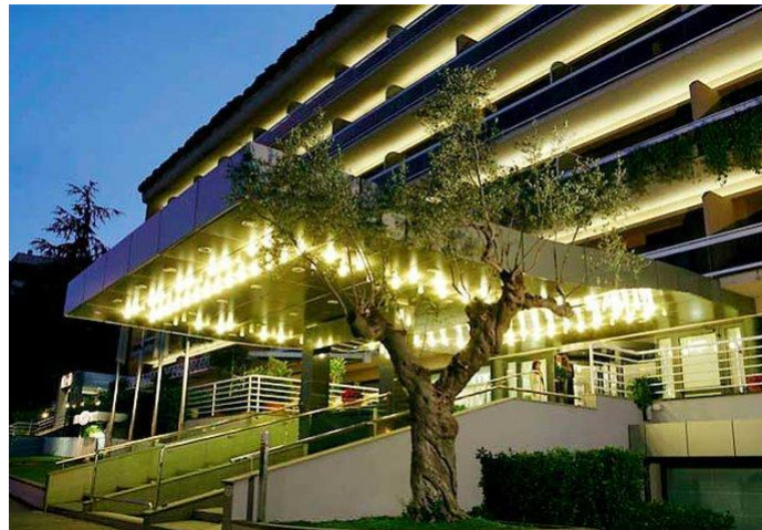
Figure 3 – Hotel Courtyard Marriott

Email: reservations@hotelcentralparkroma.com